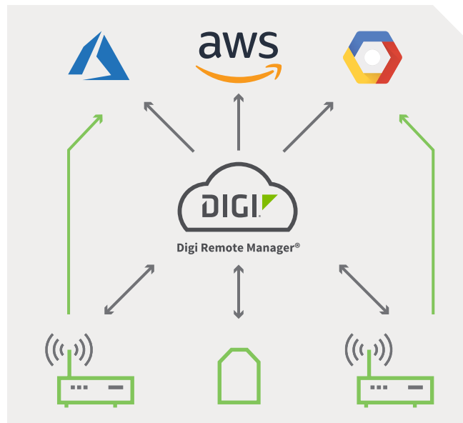
If each device requires a unique out-of-band connection to the IoT cloud, DRM 3.0 simplifies the management of the IoT client on each device.