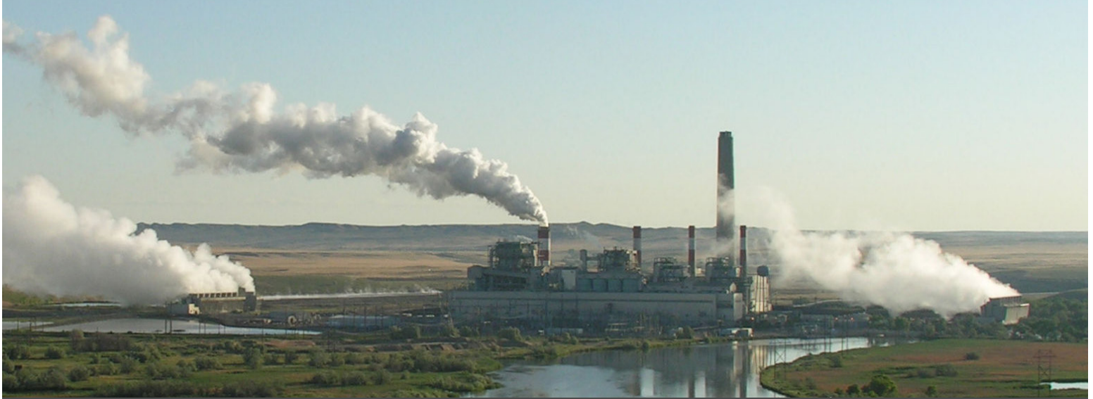
Coal Power Plant

There are more than 2,300 coal-fired power plants worldwide (with approximately 620 in China), and another 1,200 plants are in various stages of planning (primarily in China and India, but also in Russia, Turkey, Uzbekistan, Cambodia, and Guatemala). Due to increasingly stringent environmental and pollution requirements, coal use for generating power in the U.S. is declining. However, coal remains the most common fuel source for generating electricity, and more than 90% of the coal mined in the U.S. is used for generating electricity.